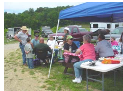
Always good food and lots of conversation!